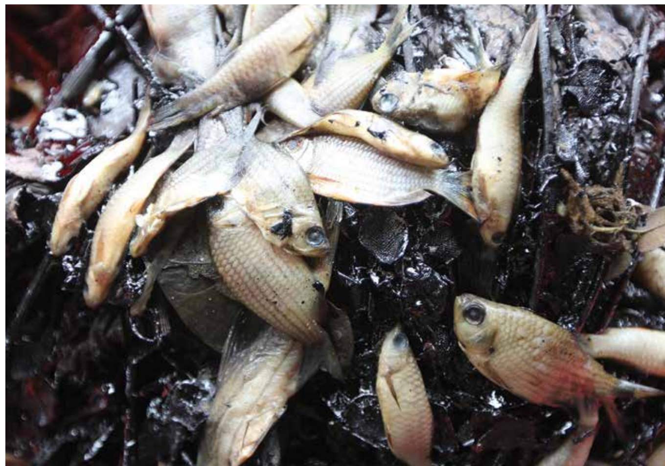
Dead fish and oily twigs gathered by villagers in Cuninico after an oil spill in June 2014.

stored, and where the boat oar had stirred up the oil slick—before it flooded, and said work would resume when the river levels went down again.