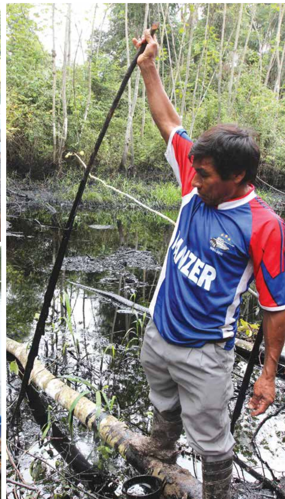
Clockwise from top left: A boy washes his hands in water purified by a new water treatment plant in Dos de Mayo. A man tests the depth of oily water after a pipeline break near the Kukama community of Cuninico, in the lower Marañón River valley in northern Peru. A woman washes clothes near the mouth of the Cuninico River, traditionally her community’s source of water for drinking, cooking, washing and bathing.