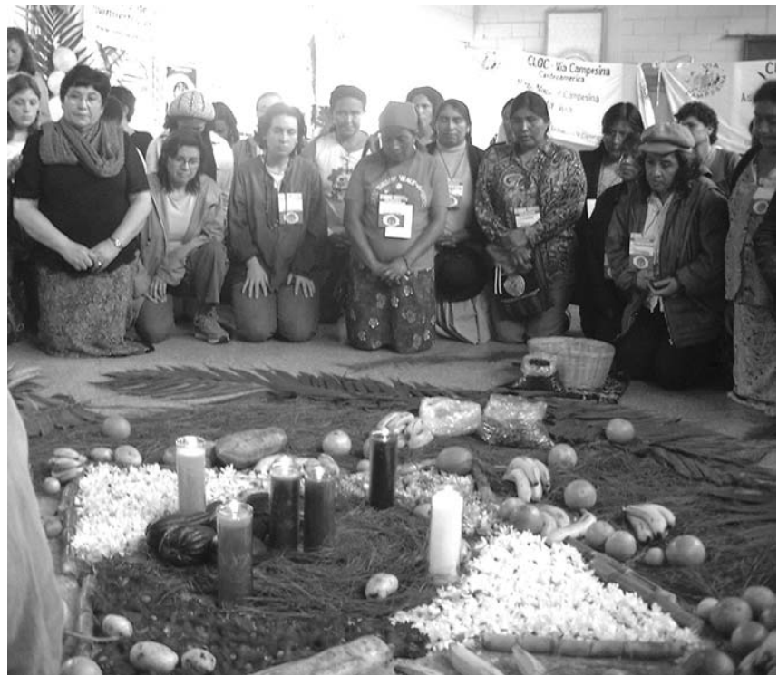
Mayan ceremony in the inauguration of the 3rd Continental Rural Women's Assembly (CLOC), Guatemala, 2005. MINGA INFORMATIVA