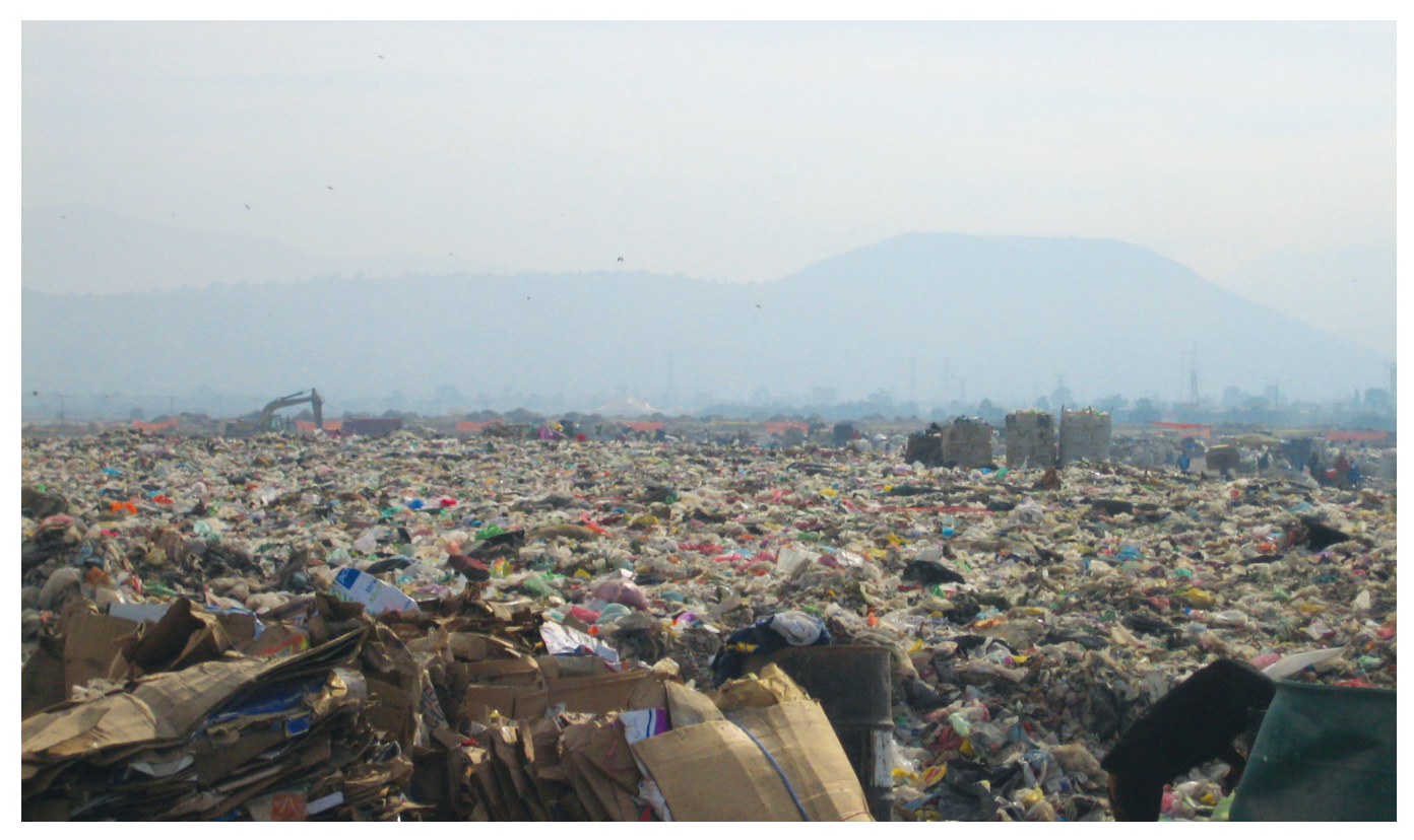
An overview of a dump.

I encountered a different problem when members of a scavenger co-op asked me to help them get rid of their corrupt leader. It was very hard not to get involved. Even terminology was a problem. Scavenging exists throughout Latin America, but nearly every country uses a different word because the Spanish language lacks a standard term for it. I knew that Mexicans call them pepenadores (derived from Náhuatl, the language spoken by the Aztecs), but not the terms used in other countries. I eventually learned that they are called catadores in Brazil; guajeros in Guatemala; minadores in Ecuador; clasificadores in Uruguay, recicladores in Colombia; cartoneros in Argentina, and so forth. Buzos, one of the most common terms, is used in Cuba, Costa Rica and Bolivia.