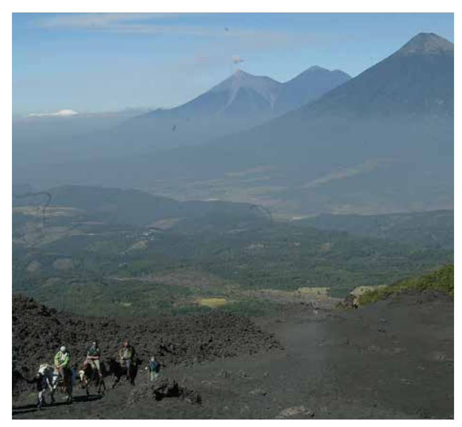
Above: Volcanos in Guatemala; Opposite page: women walk past Caripito Refinery.

watt-hours per year (GWh/y). But during the same time span, electricity generated from imported diesel fuel exploded from a mere 16 to 12,345 GWh/y. Overall, imported fossil fuels accounted for only ten percent of the region's electricity generation in 1990, but today they account for over forty percent. The region's marked shift away from renewables such as geothermal and hydroelectric power since the 1990s is highly problematic from both environmental and economic viewpoints. When oil prices spiked in the mid-2000s, the newly fuel importdependent Central American countries faced financial shortfalls as high as three percent of GDP.