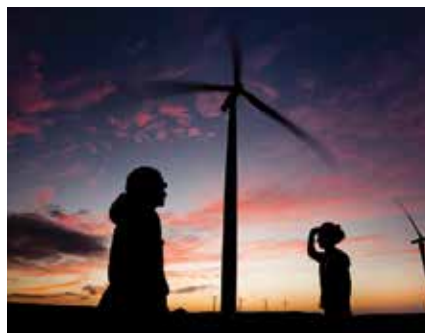
Wind energy in Marcona, Peru.

Nevertheless, wind energy is still a relatively underexploited resource across the region, particularly in relation to its vast potential.