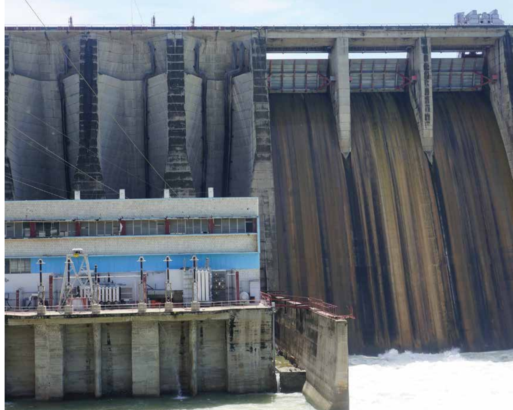
Discharge side of a hydroelectric plant, Péligre Dam in Haiti: in the background, the dam with the spillways for discharging excess water; in the foreground, the powerhouse, where the turbines and generators are located.

Many Latin American countries, having restructured their electricity sectors to give a more prominent role to private